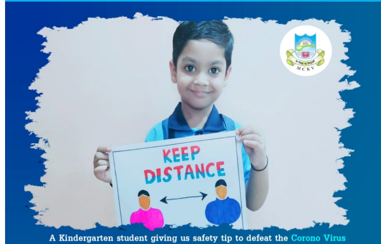
A Kindergarten student giving us safety tip to defeat the Corona Virus

Due to the outbreak of Corona Virus we have been forced to confine ourselves within the four walls of our homes but the zeal of MCKV family was never affected by the pandemic. Teachers and parents have worked hand in hand to make this period as much creative and productive as possible for the children. The children have put in lot of effort and very enthusiastically participated in all the activities given to them by their teachers. The various interesting activities that had been planned are sorting of different pulses, palm painting, non-fire cooking, vegetable printing, standing line activities, sleeping activities, yoga, making of the family tree, red balloon rhymes activity, learning about shapes activity and many more. Some of them were also involved in the lockdown videos made by the school. We all appreciate the way this lockdown period has been transformed to fun filled days.