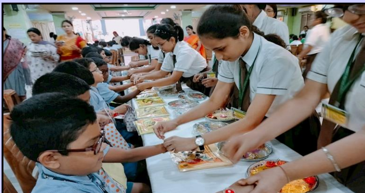
MCKVians of Class 4 visited Agrasain Balika Shiksha Sadan to celebrate Raksha Bandhan