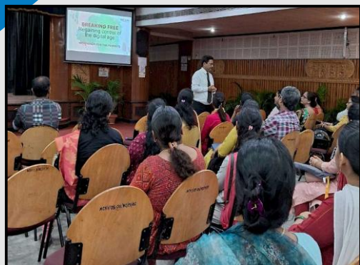
Screen Time: The struggle to find the right balance – An interactive session with the parents of Class 4