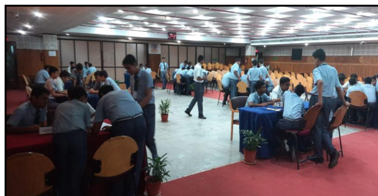
MCKV Bank: A transformative mock bank event was organised by the Department of Commerce to help the students of Class 8 delve deep into the realities of banking, gaining a comprehensive understanding of the industry.