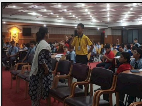
Managing Emotions: An interactive session with the students of Class 6