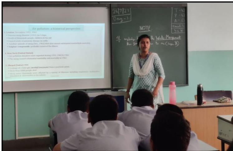
A Session on 'Effect of Air Pollution on Health'