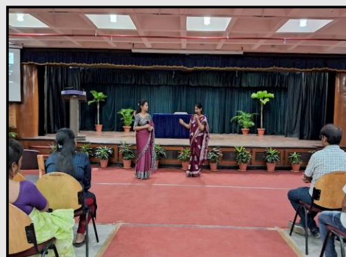
Exploring the Power of Dance: A session on dance movement therapy for the parents of Class 5

For more detailed reports and photographs, please visit our website, www.mckv.edu.in .