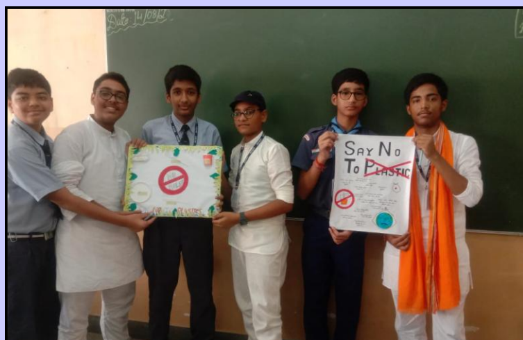
Interact Club's Eco Warriors: MCKVians unite against plastic pollution