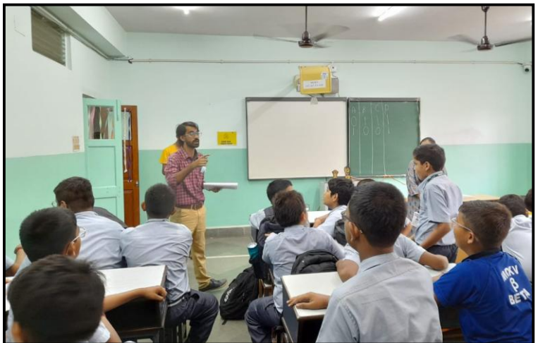
Quiz Competition after the students returned from their visit to the East Kolkata Wetlands