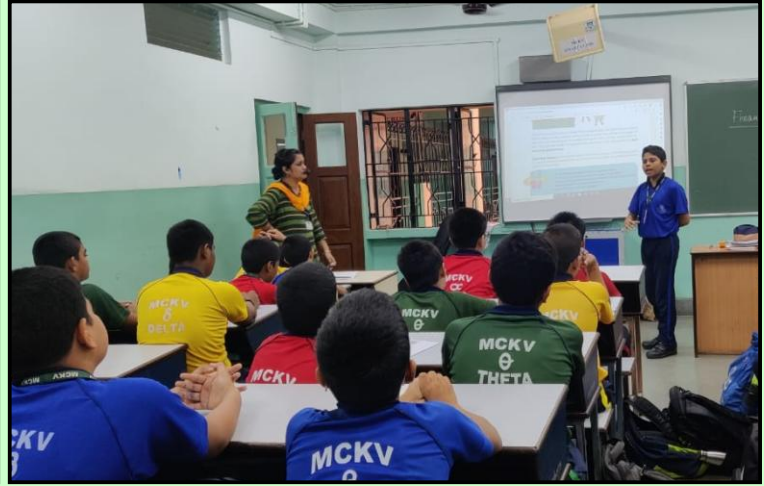
A Session on Financial Literacy