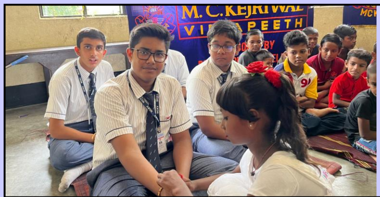
Interactors of Class 11 celebrated Rakhi with the underprivileged children at Mahajiban