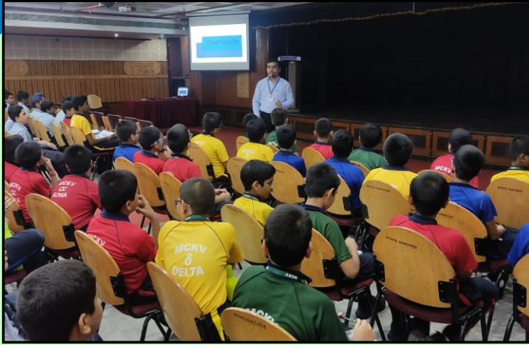
Workshop on Cyber Security