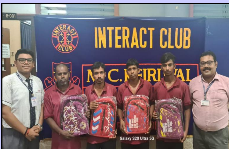
Spreading Smiles: Interact Club gifted school bags to ancillary staff's children