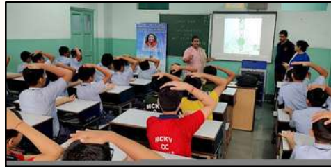
Sahaj Yoga Sessions