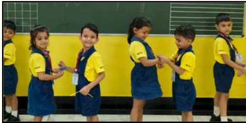
Friendship Day Celebrations