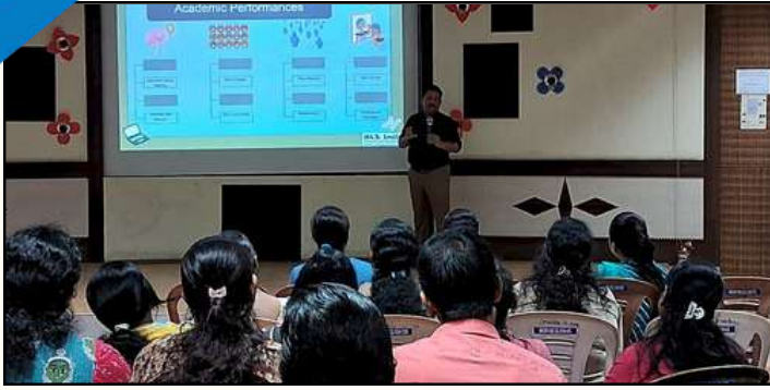
Teen Connect: Navigating Adolescence Together