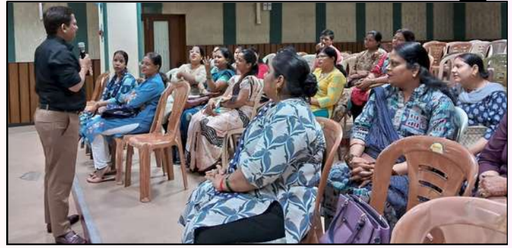
Navigating Career Choices: A Guide for Parents