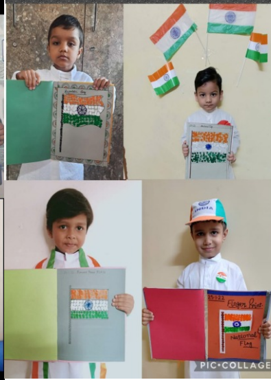
Nursery Republic Day Craft