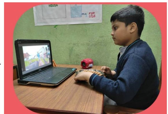
Virtual Educational Trip to 'The Science Museum for Children' Class 3

Overall, the trips were a breath of fresh air for our students and rejuvenated their minds and satiated their urge for knowledge.