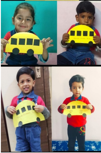
Activity on Land Transport Making of School Bus Pre-Nursery