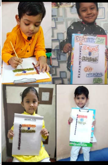
Republic Day Celebration Making of National Flag Pre-Nursery