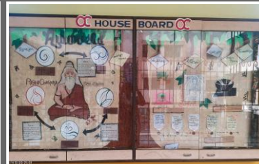
Third position: Alpha House Topic:- Great inventions of India: Ayurveda