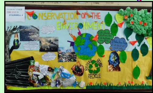
Senior School Topic: Conservation of Environment Class: 9A