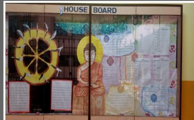
Second position: Beta House Topic:- Great inventions of India: Yoga