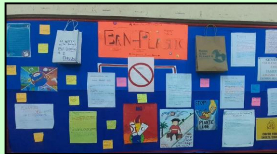
Middle School Topic: Ban Plastic Class: 7D