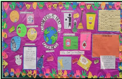
Junior School Topic: Cleanliness Class: 4D