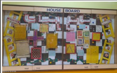
First position: Delta House Topic:- Great inventions of India: Board Games