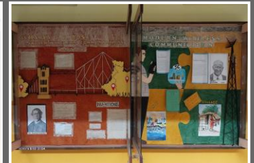
Third position: Theta House Topic:- Great inventions of India: Wireless Communication