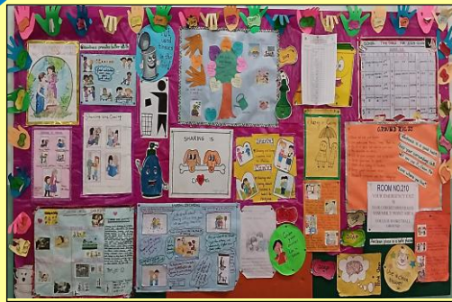
Topic for Classes 1-4: Sharing and Caring Winner: Class 4D