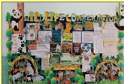
Topic for Classes 5-8: Wildlife Conservation Winner: Class 5B