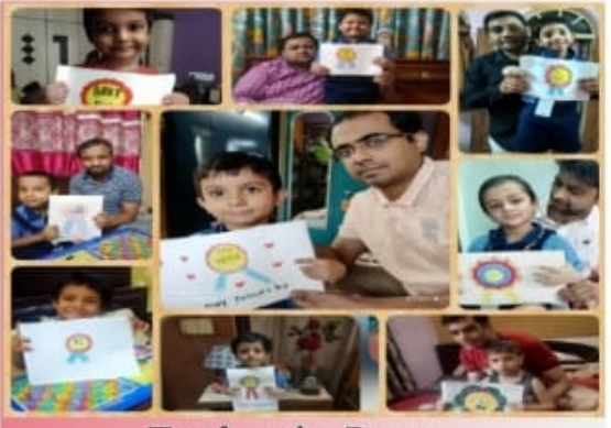
Father's Day Celebration (KG)

Father's Day is celebrated worldwide to recognize the contribution that fathers make to the lives of their children. The students of Pre-primary section of M.C.K.V. celebrated Father's Day with a lot of enthusiasm on 19th June,2020. Teachers of the Nursery and KG sections organized craft activities where both the children and their fathers enthusiastically participated. Children of Pre-Nursery classes were helped by their real-life super heroes, their fathers, in non-fire cooking.