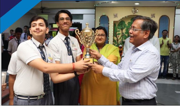
Delta House received the Best in Academics trophy