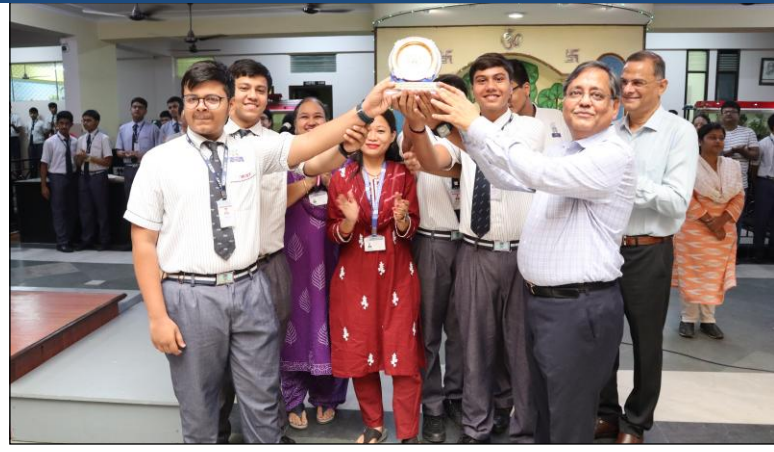
Beta House won the Best in Extra-Curricular Activities and the Cock House trophies