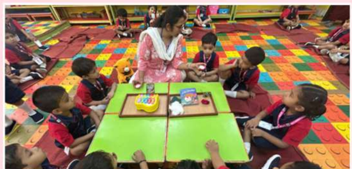
Finnish Curriculum in the Foundational Stage, with young learners exploring the concept of "Every Part of Me".