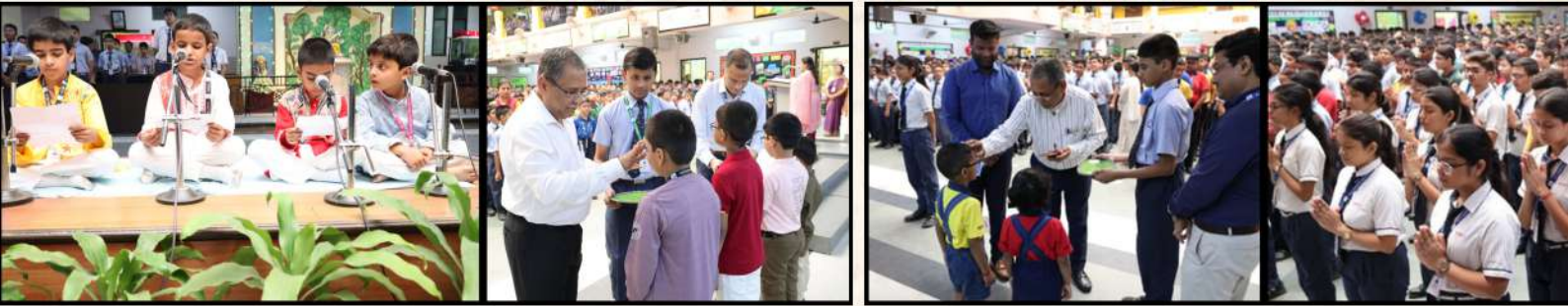
A new chapter unfolds marking the commencement of the session 2026–2027