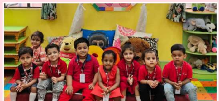
Nursery children celebrating "Red Day"