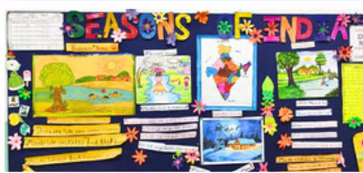
Topic for Classes 3-5: The Beauty of Seasons Winner : Class 5D