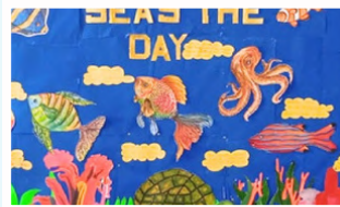
Topic for Classes 6-8: Marine Life: A Hidden World Winner : Class 6D