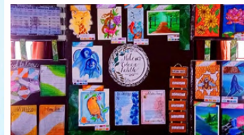
Topic for Classes 9-12: Nature's Colour Palette Winner : Class 9E