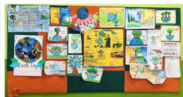
Topic for Classes 1-2: Save Trees. Save Earth Winner : Class 2D