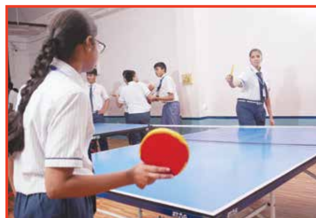
Table Tennis Room