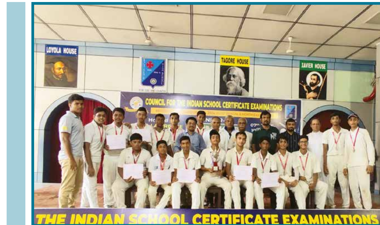
Cisce Cricket Tournament 2024

M. C. Kejriwal Vidyapeeth has been ranked 6th in the country, 2nd in the state, and 1st in Howrah in the Boys' Day School category of the Education World India School Rankings 2024-2025. We extend our heartfelt thanks to our parents, students, and the entire MCKV team for their unwavering support and contributions, which have enabled the school to secure a place among the nation's top institutions.