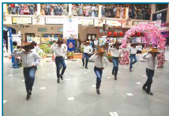
United States of America