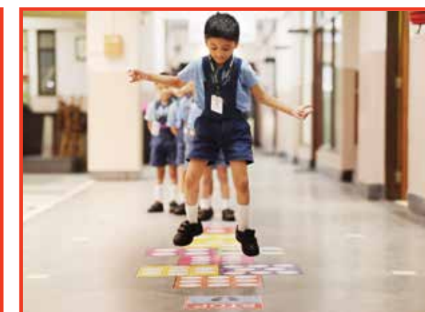
Visual Learning Spaces